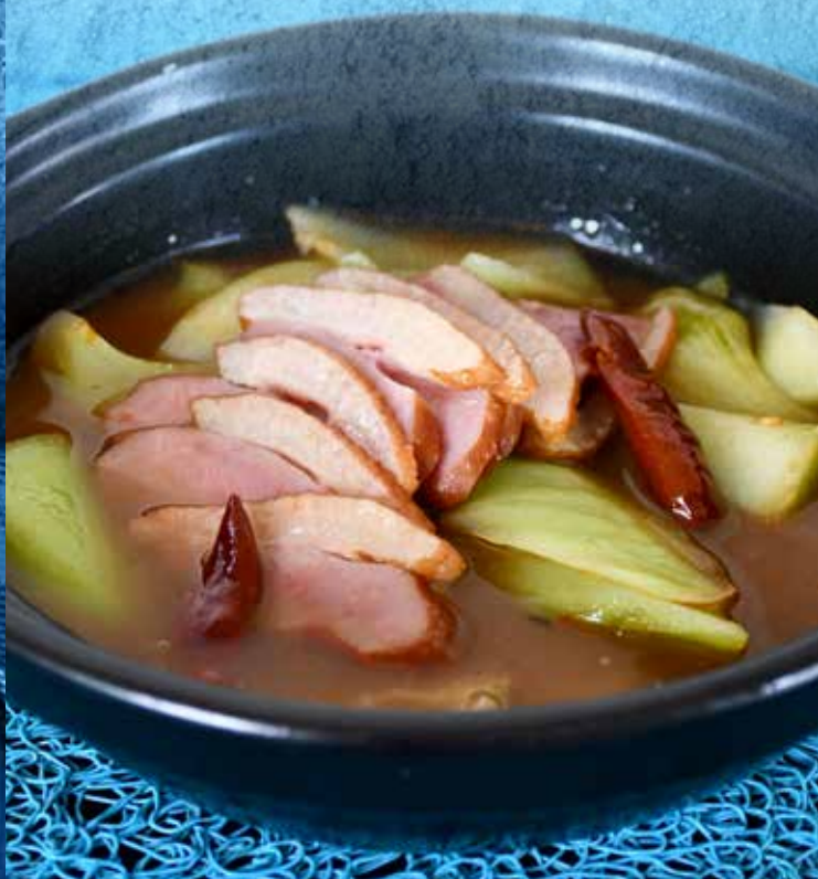
Braised Mustard Leaf with Smoked Duck $8.50