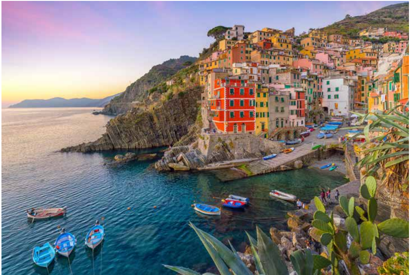
Riomaggiore, found on the eastern end of the Cinque Terre.