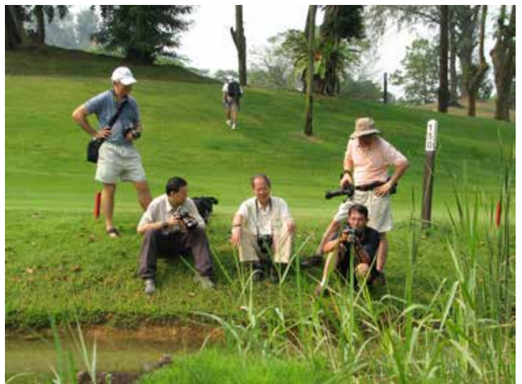
Club members having photo adventures and admiring nature around the golf course.

The animals, flora, and fauna that can be found around Keppel Club's clubhouse and golf course are as much a part of our heritage as our members. Coming down to the golf course and encountering a monitor lizard ambling along or going for a swim, or catching a glimpse of the white-bellied eagle soaring through the sky makes for a different experience every game, especially for nature buffs.