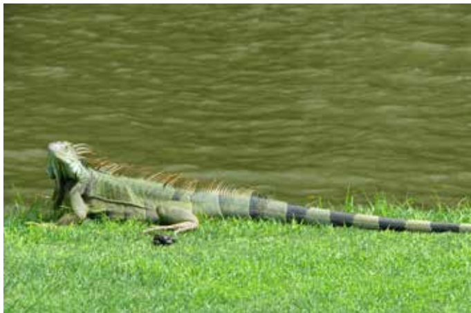
With plenty of sun and pools of water, reptilian friends have a great time sunbathing or even cooling off on our course.