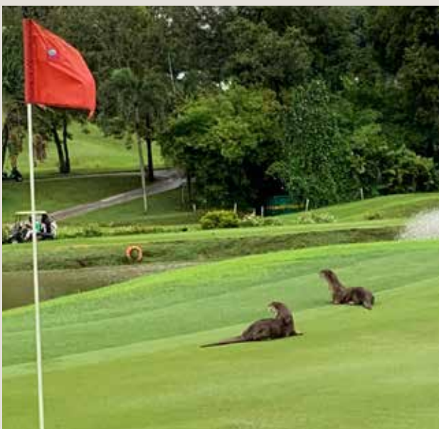
Otters lounging on the greens.

Some of these animals are well known to older Keppel Members, like the white-bellied eagle that has made its home at three different Albizia trees over the years—unfortunately, two of its older homes were hit by lightning, and it had to relocate to the third Albizia tree, which still stands today. Apart from that, members might also be familiar with the playful parakeets that tend to hang around Holes 9, 10 and 11, darting around as you enjoy a good game of golf.