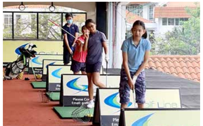
Watching the example in between their skills test.

To give them more opportunities to practice, Keppel Juniors in the programme are also given an additional 500 balls at the driving range, on top of what is used during the practice sessions.