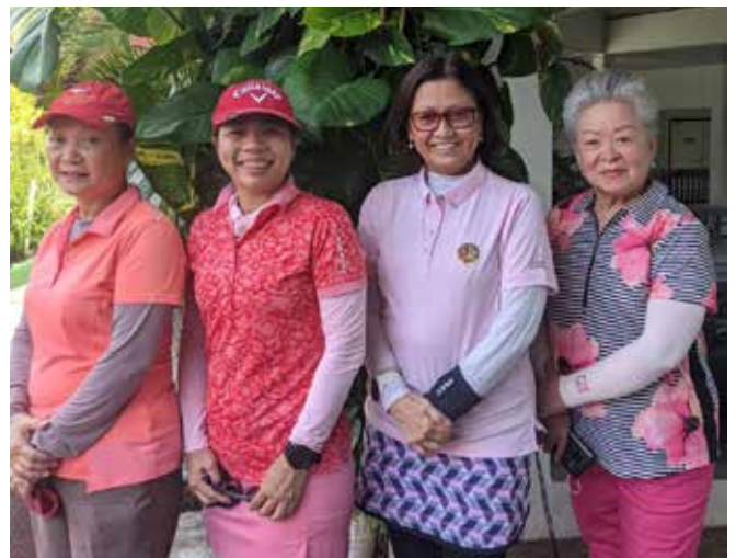
In sync with pink for these ladies.

Above all, we are heartened to see that all attending enjoyed a good game of golf with the cheerful and friendly atmosphere that is synonymous with Keppel Club.