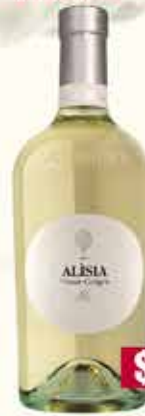
ASTORIA Alisia Pinot Grigio 2016