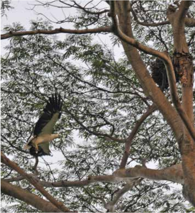
Even powerful birds of prey must rest—and what better place to do that than in our golf course's Albizia tree?