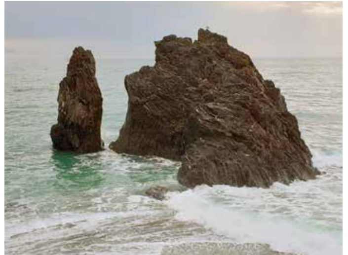
Enormous rocks that stand guard along the beach of Monterosso. - Helen Neo

Opposite the church was its freestanding bell tower and a 16th-century watchtower. Although few