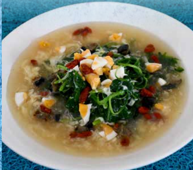
Stir-Fried Spinach with Trio Egg $8.50