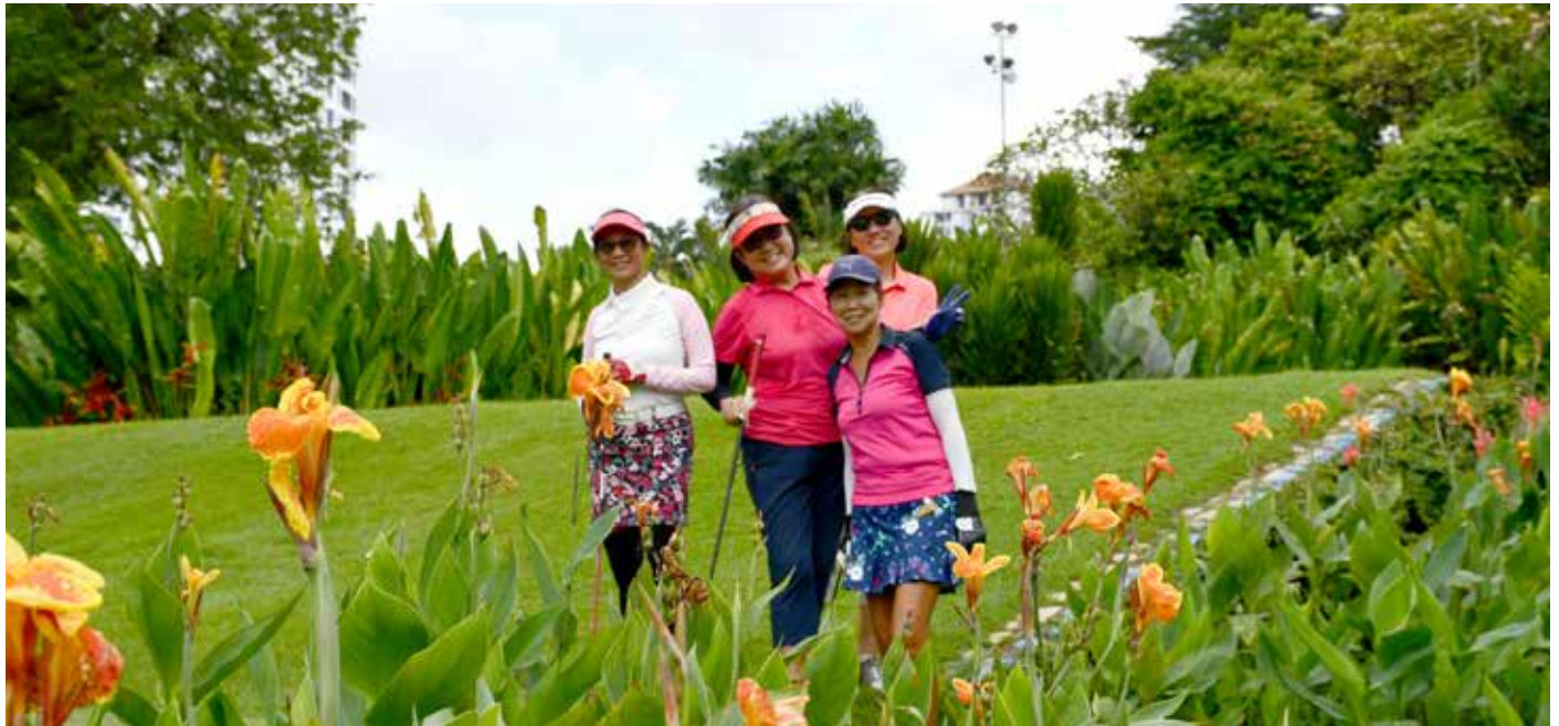
Striking a pose and then going on to have a great game is no problem!

The afternoon of Feb 5, 2021 saw our greens brightened by the wide smiles of the lovely ladies of Keppel Club, gathered for the Chinese New Year ladies fun game.