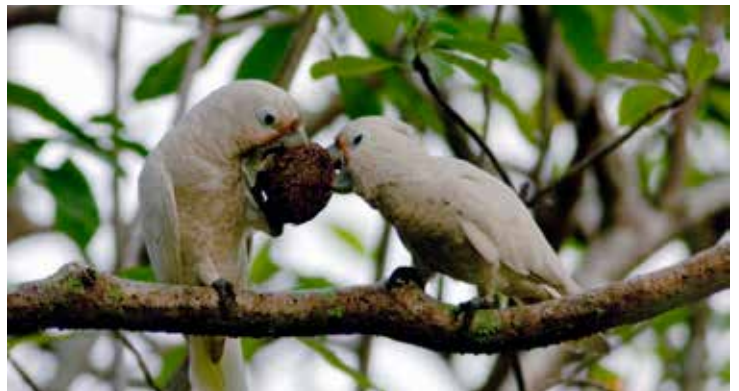
Parakeets having a feast.