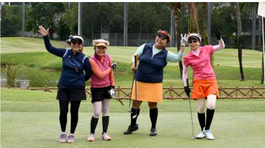
Ox headbands and bright colours, many of our ladies easily added colour to Keppel Club's greens.