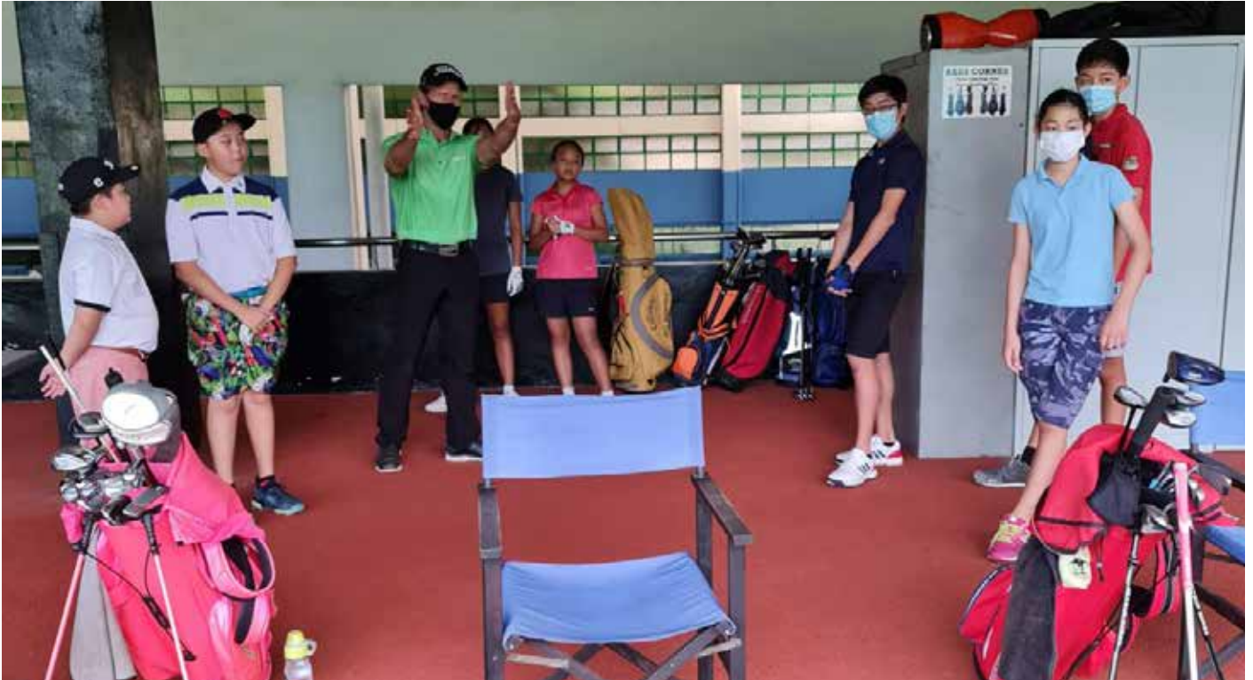
Listening carefully to instructions as they were being briefed on the exercise to follow.

The evening of Jan 16, 2021 brought with it a buzz of nerves and excitement as 15 of our Keppel Juniors gathered at the driving range to trial for the Junior Elite Training (JETs) programme. During the trial, many of the juniors showcased a good mix of experience and potential, with Golf Line School coaches noting that several displayed a serious amount of clubhead speed for their age.