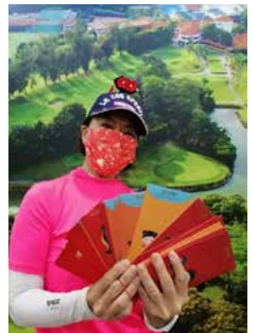
Members registering for their flights in the early morning, and getting their goodie bags which included oranges, golf balls, a CNY themed mask, and a toto ticket for the next day's draw!

The third day of Chinese New Year was off to a sunny start with this year's rendition of the Fa Cai Game. Unlike previous years, there was no dinner due to COVID-19 celebrations, but members were all smiles regardless as they enjoyed a fun game of golf under the pleasant sunny and windy weather.