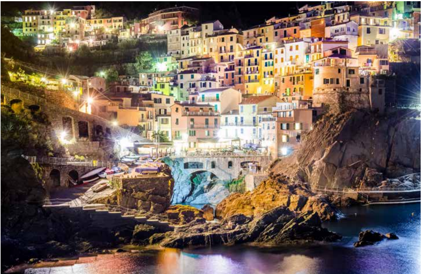
Manolara by night.

This site is different from visiting traditional must-see historical man-made sites such as the colosseum, artworks, churches, palaces, museums and castles. Here, it's the landscape, the ambience, beauty and fresh air that excites our senses by walking the breathtaking paths along the cliffs, pausing over gelato in a café which we couldn't resist despite the cold winter, surrounded by candy-coloured houses and capturing pictures of Italy's best views and just absorbing the Old World charm.